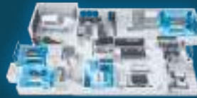
Zoning at night