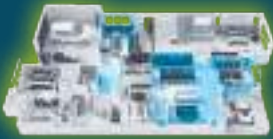
Zoning during the day

Zoning your new ducted air conditioning system will mean that everyone can enjoy their own temperature and airflow, and you can save on energy and running costs by turning off the airflow for rooms not in use.